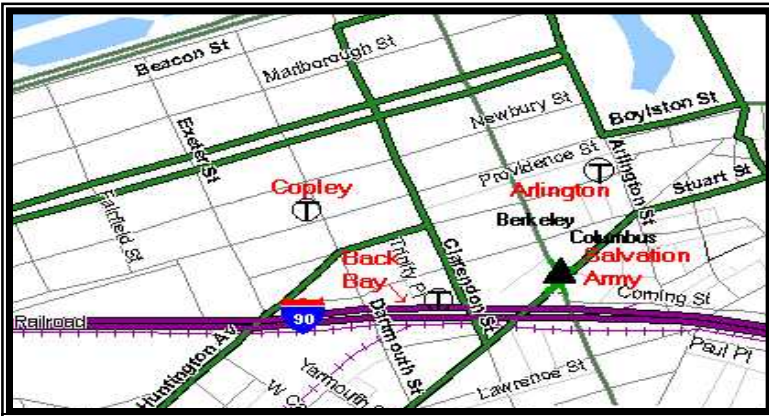
General Meeting – Boston Salvation Army Corner of Berkeley St. and Columbus Ave.