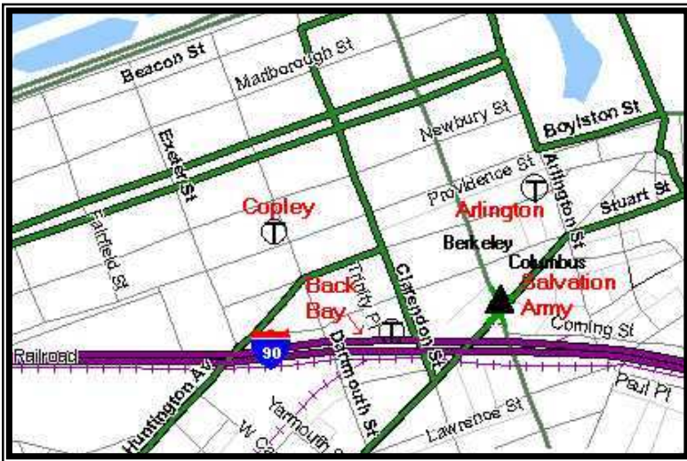
General Meeting – Boston Salvation Army Corner of Berkeley St. and Columbus Ave.