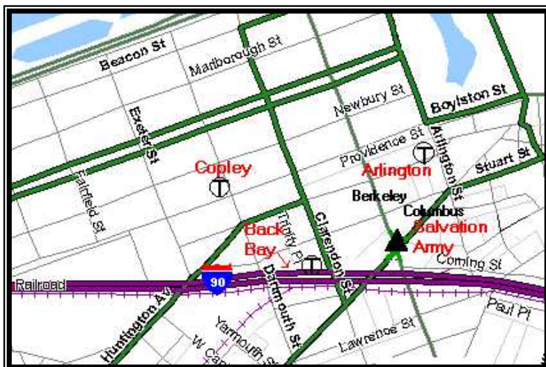
General Meeting – Boston Salvation Army Corner of Berkeley St. and Columbus Ave.