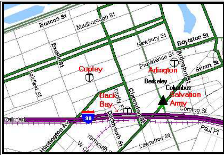
General Meeting – Boston Salvation Army Corner of Berkeley St. and Columbus Ave.