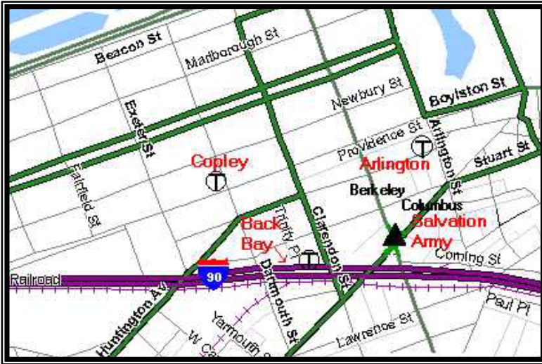
General Meeting – Boston Salvation Army Corner of Berkeley St. and Columbus Ave.