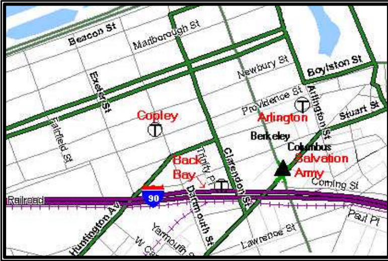
General Meeting – Boston Salvation Army Corner of Berkeley St. and Columbus Ave.