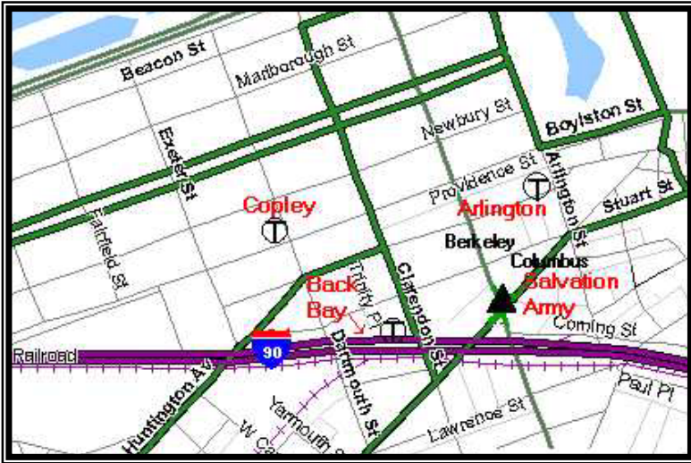
General Meeting – Boston Salvation Army Corner of Berkeley St. and Columbus Ave.