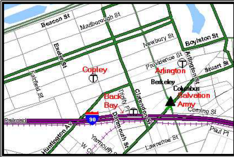
General Meeting – Boston Salvation Army Corner of Berkeley St. and Columbus Ave.