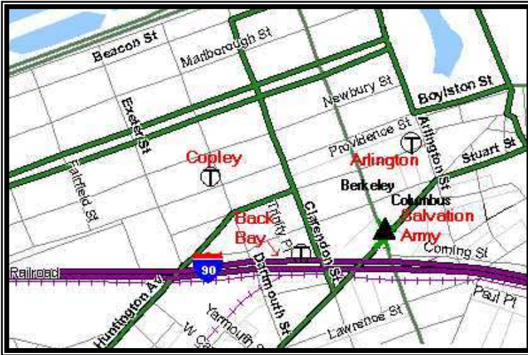
General Meeting – Boston Salvation Army Corner of Berkeley St. and Columbus Ave.