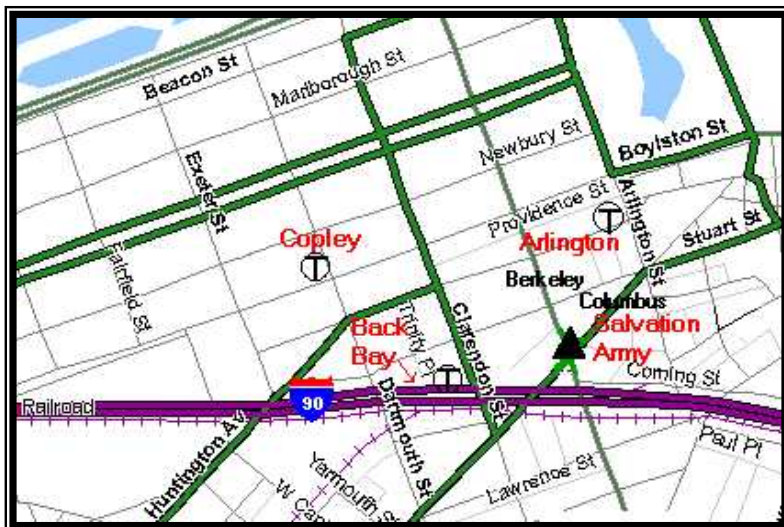
General Meeting – Boston Salvation Army Corner of Berkeley St. and Columbus Ave.