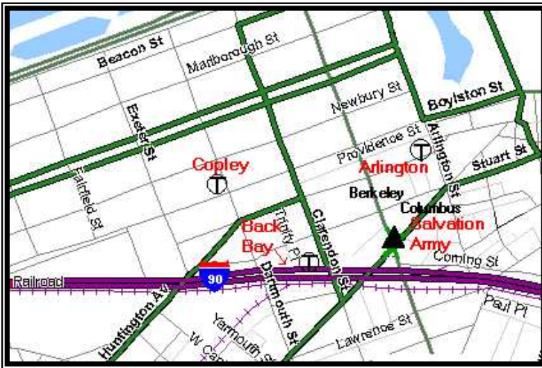
General and Business Meetings – Boston Salvation Army Corner of Berkeley St. and Columbus Ave.